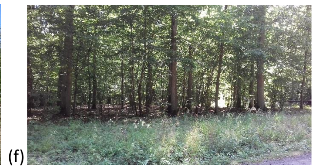
Fig. Research sites: urban (a, b), suburban (c, d) and rural (e, f).