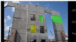
Center for the Arts

Name: SafeGuard #1 Desc: Safety Report #1902